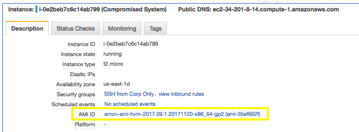
Figure 4 – Identifying the AMI to use for the Hash Database

The known files hash list will be generated on the SIFT Workstation from the same AMI that was used to launch the instance as determined by looking at the original metadata associated with the compromised instance. See Figure 4.