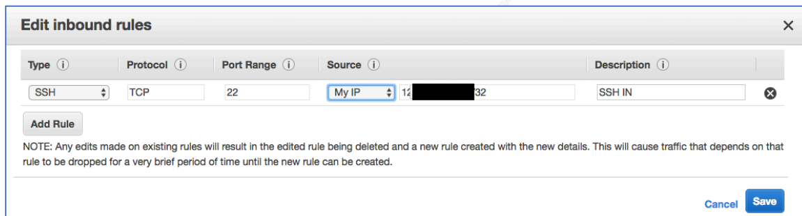
Figure 2 – Configure Inbound Rules to Allow SSH from a Single IP Address

sudo chmod 755 /usr/local/bin/sift sudo sift install