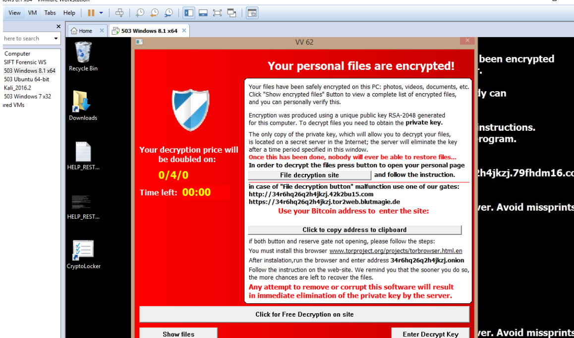
Additional Warning Screen with Ransom Paying Scheme and Countdown Timer