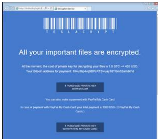
Decryption Website Asking for 1.5 Bitcoins Ransom