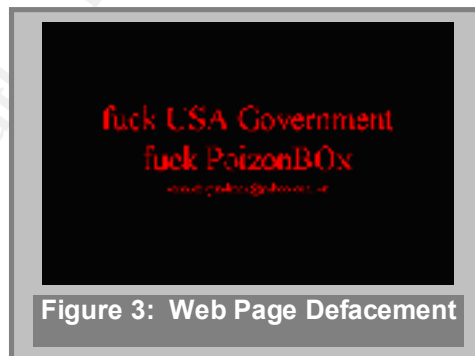
Figure 3: Web Page Defacement

This was the first incident at this Organization of The Company within the last 5 years, and is the first real incident handled by this Incident Handler.