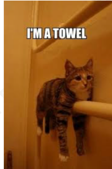
Figure 12: funny-cat-2.jpg