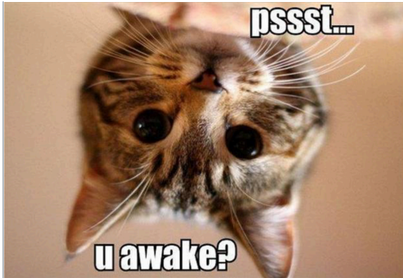
Figure 11: funny-cat-1.jpg