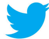
Figure 14: twitter-bird.jpg

An encrypted copy of funny-cat-1.jpg is included with the other test files. This file will be used in remaining demonstrations that require an encrypted file. The command used to encrypt was the following. The password is intentionally obfuscated to allow the reader to attempt to learn the password using techniques presented 13 .