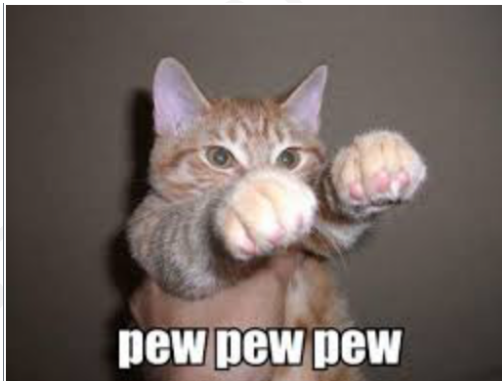
Figure 13: funny-cat-3.jpg