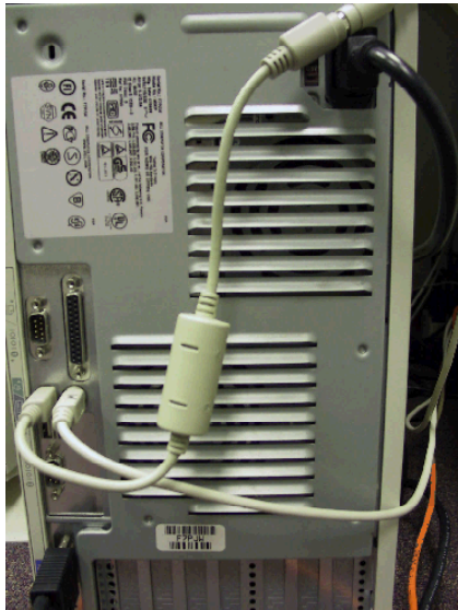
Keyboard cable with KeyKatcher installed