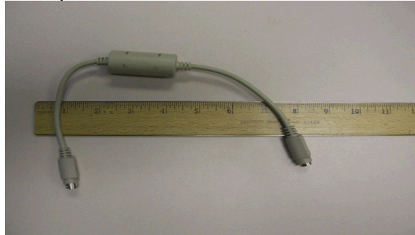
Keyboard cable with KeyGhost installed