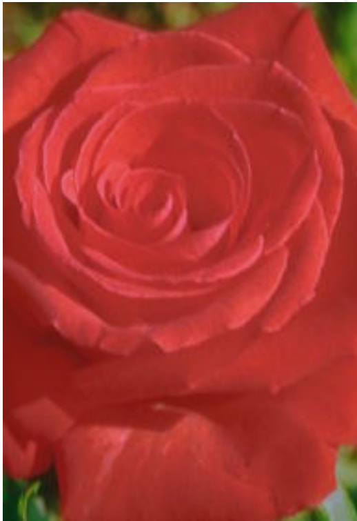
(B) Stego-Image containing embedded message (in this case, the Nursery rhyme "Mary Had A Little Lamb").