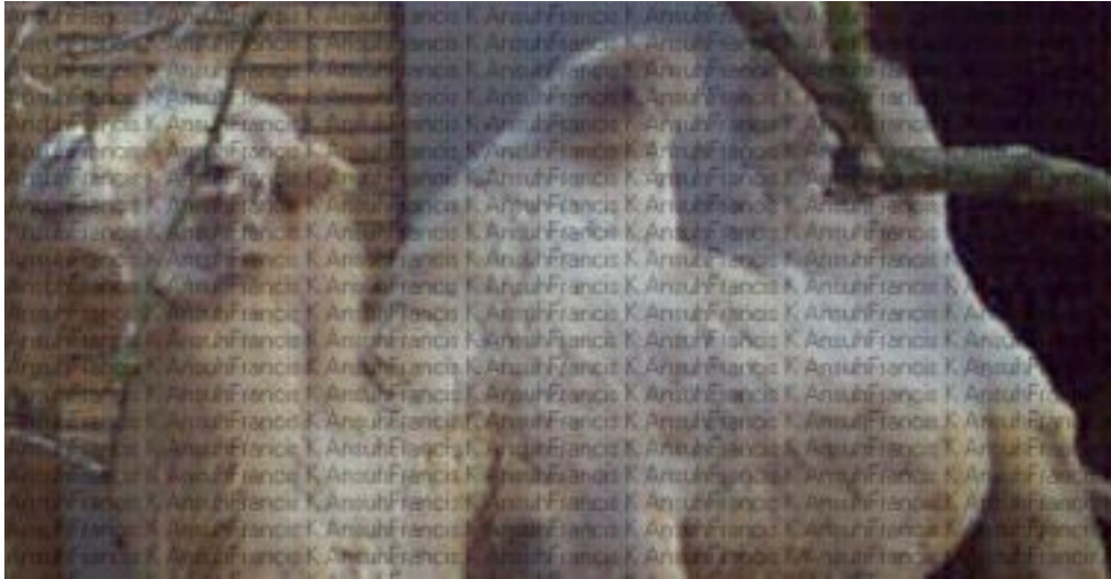
(A) Cover image has been painted repeatedly with a small -sized image (watermark) Note that the image "Francis K Ansu" can still be read if the cover image is cropped.

image and there is a high probability that the message (watermark) can still be read after the image has been cropped. A large message on the other hand may be painted only once across the cover image and will therefore be vulnerable to cropping ( figure 2 ).