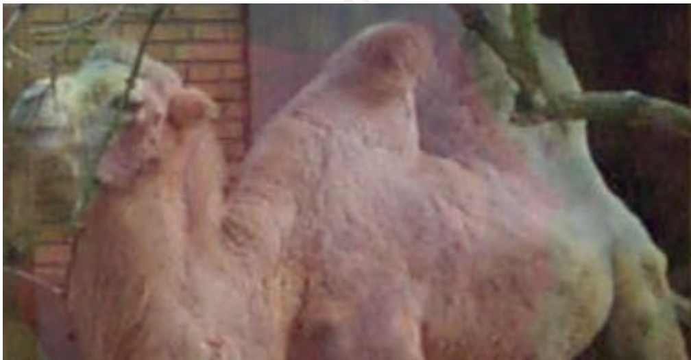
(B) Cover image has been painted only once with a big -sized image (watermark) of a red rose.

Figure 2. Above illustrates the trade-off between the size of the hidden message and robustness. Please note that for demonstration purposes only, the luminance of the hidden message has been manipulated to make it visible.