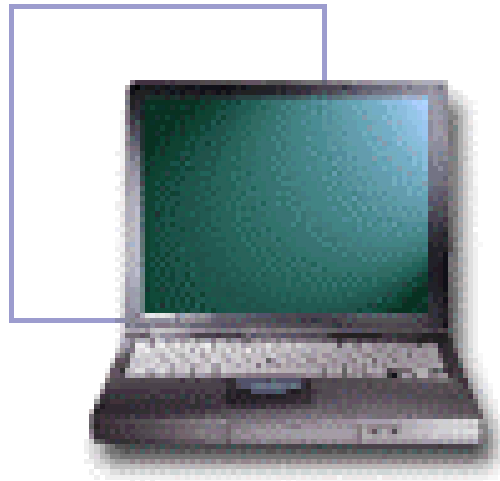
Figure 1 Cover Image

As a security professional you are concerned with your organizations proprietary information being removed from your premises without your knowledge. Steganography provides the tools to do just that. Employee data, pricing data and rates, etc can be easily smuggled out right under your nose. Utilities that look for "dirty words" or key phrases are not going to be able to detect information that has been concealed.