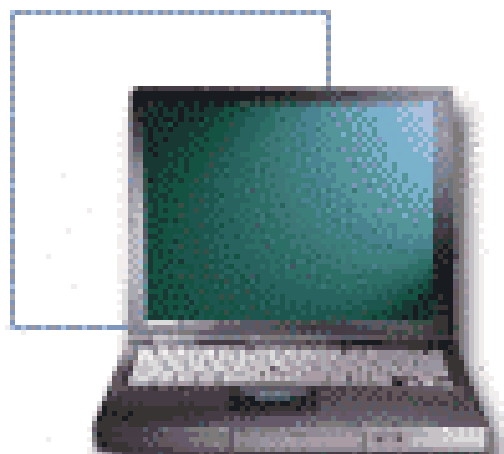
Figure 2 Stego Image

Steganography works, in some cases, by using the least significant bit (LSB) in a byte. By encoding the LSB of every byte in the file we are able to secrete data in an otherwise harmless file. In a bitmap file, as shown in figure 1 and figure 2, we can see some degradation of the image. In a