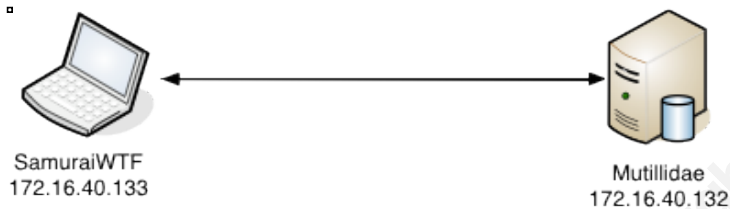
Figure 1. The testing environment