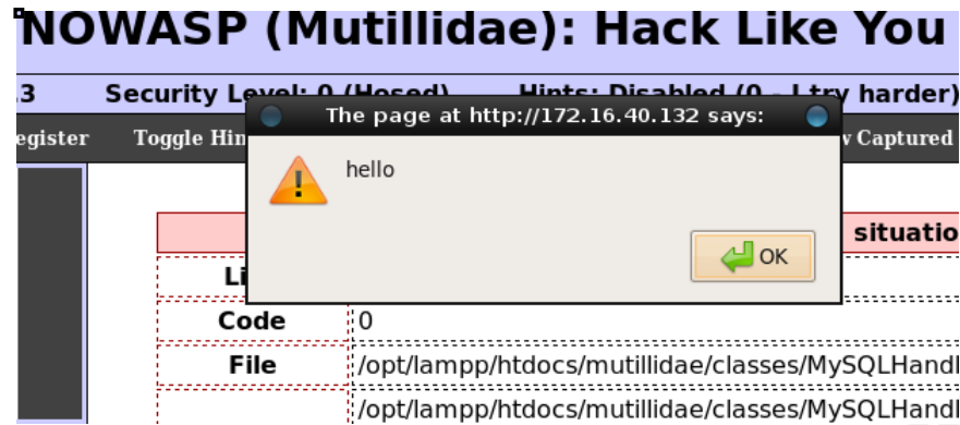
Figure 24. Successful XSS attack

When looking at the wireshark result from the XSS exploit we can see the same thing as already seen in the SQL injection section. Mutillidae does not provide any kind of encoding or filtering and in this case the exploit is easily recognized. All malicious data is within the POST body.